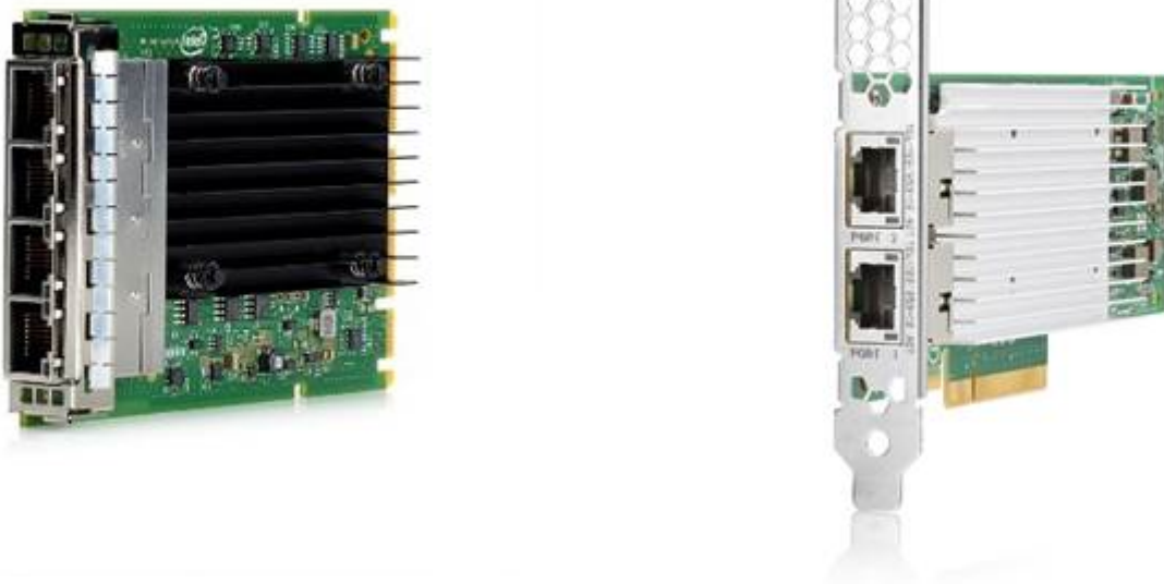
HPE Gen10 Plus Ethernet Adapters

With Gen10 Plus ProLiant Servers, HPE is offering the industry's most secure server platform. Through its Root of Trust server design down to the Network Interface Card (NIC), these security features are built-in so you can deploy with confidence. HPE Gen10 Plus servers will help prevent, detect and recover from cyberattacks such as denial of service and malware-infected firmware. Protecting applications, data and infrastructure from security breaches through storage and networking security technologies is first priority for HPE Gen10 Plus Servers.